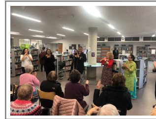
Dancing with Satish Shah